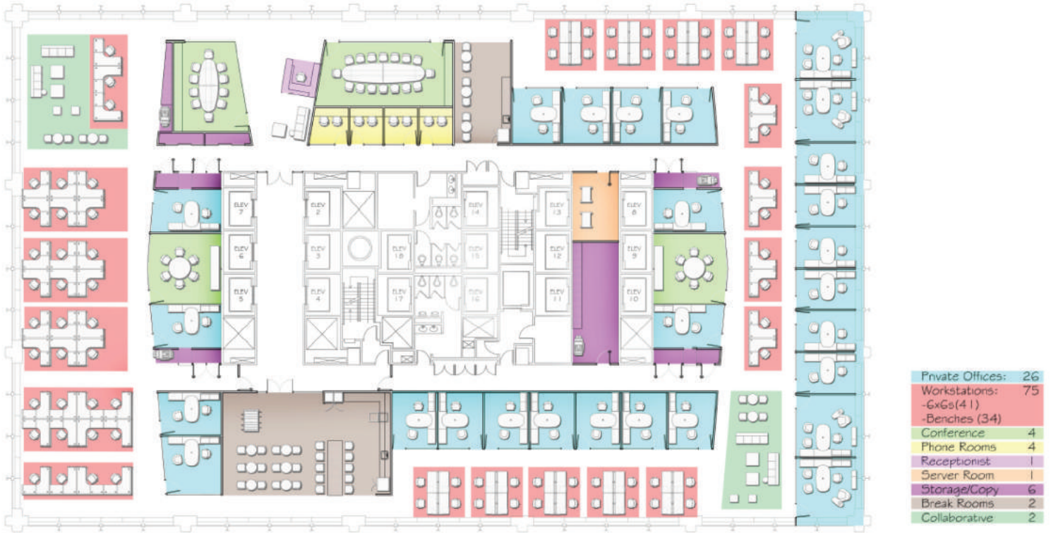
Typical Low-Rise Plan: 212 RSF/Person